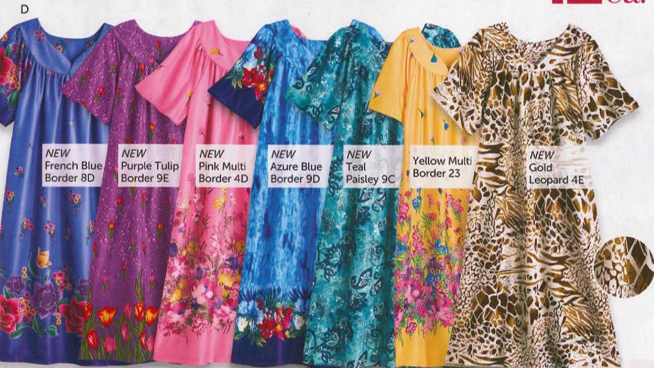
NEW French Blue Border 8D