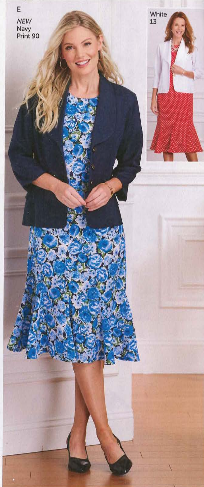
E NEW Navy Print 90