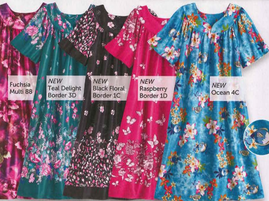
Fuchsia Multi 88